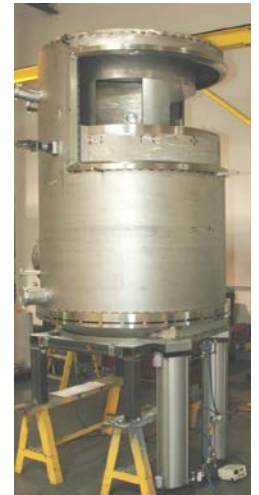
Vacuum chamber with Integrated Sealing Mechanism