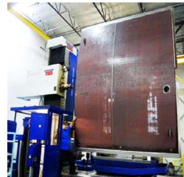
CNC Milling of Large Workpiece